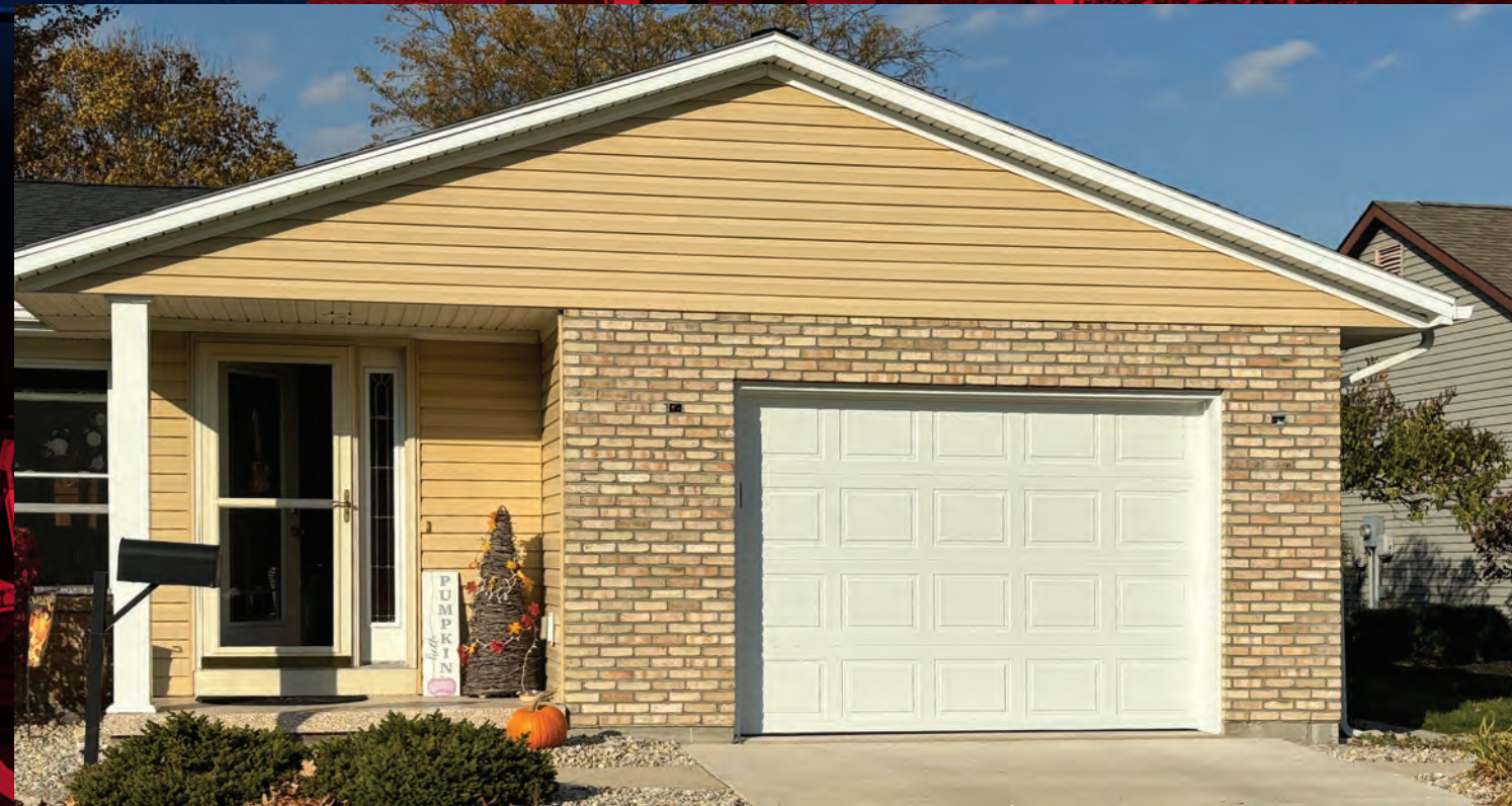
4. AFTER RESTORATION