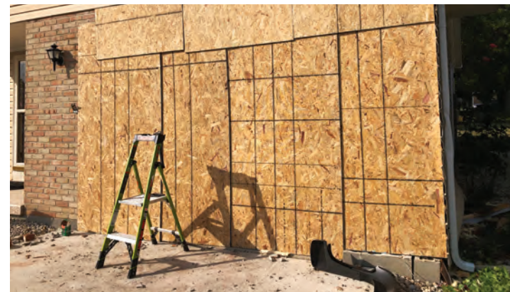
EMERGENCY BOARD UP SERVICES