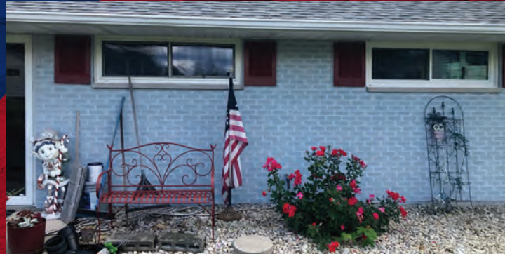
4. AFTER RESTORATION (OUTSIDE)