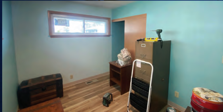
4. AFTER RESTORATION (INSIDE)