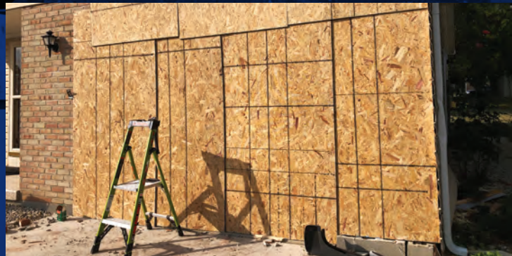
2. EMERGENCY BOARD UP