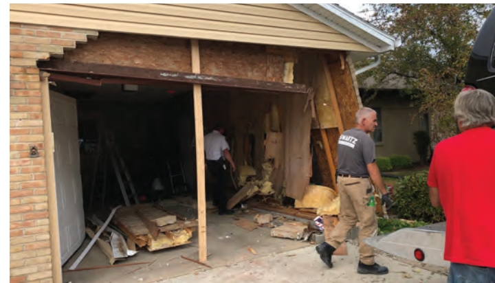
EMERGENCY BOARD UP SERVICES

With Matterport's new Property Intelligence feature, we can easily and safely obtain automatically generated measurements, floor plans, and property reports. This is another way that we want to show our customers that "We Care".