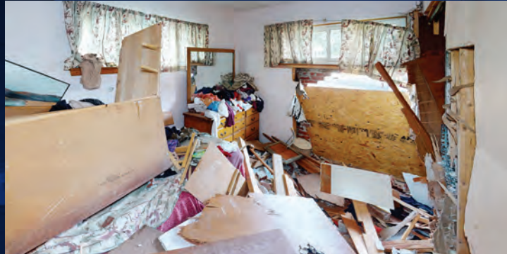
1 & 2. BEFORE & EMERGENCY BOARD UP